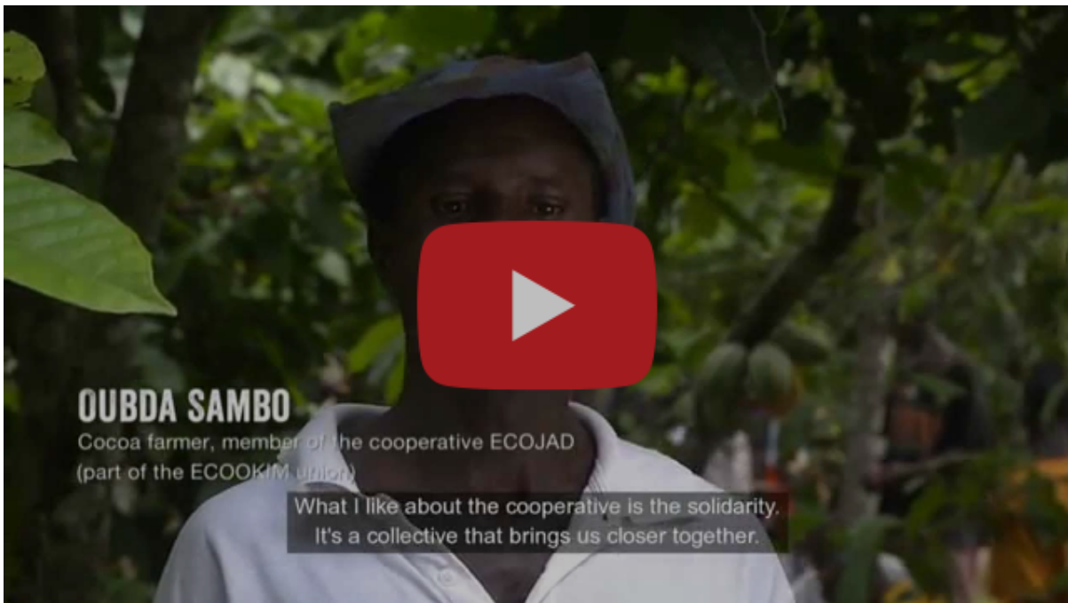
Chocolate and Coffee industries are notoriously two of the worst offenders abusing children