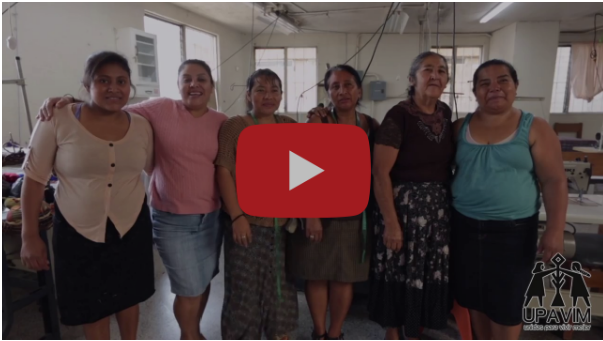
Watch this video on UPAVIM Crafts in La Esperanza, Guatemala City